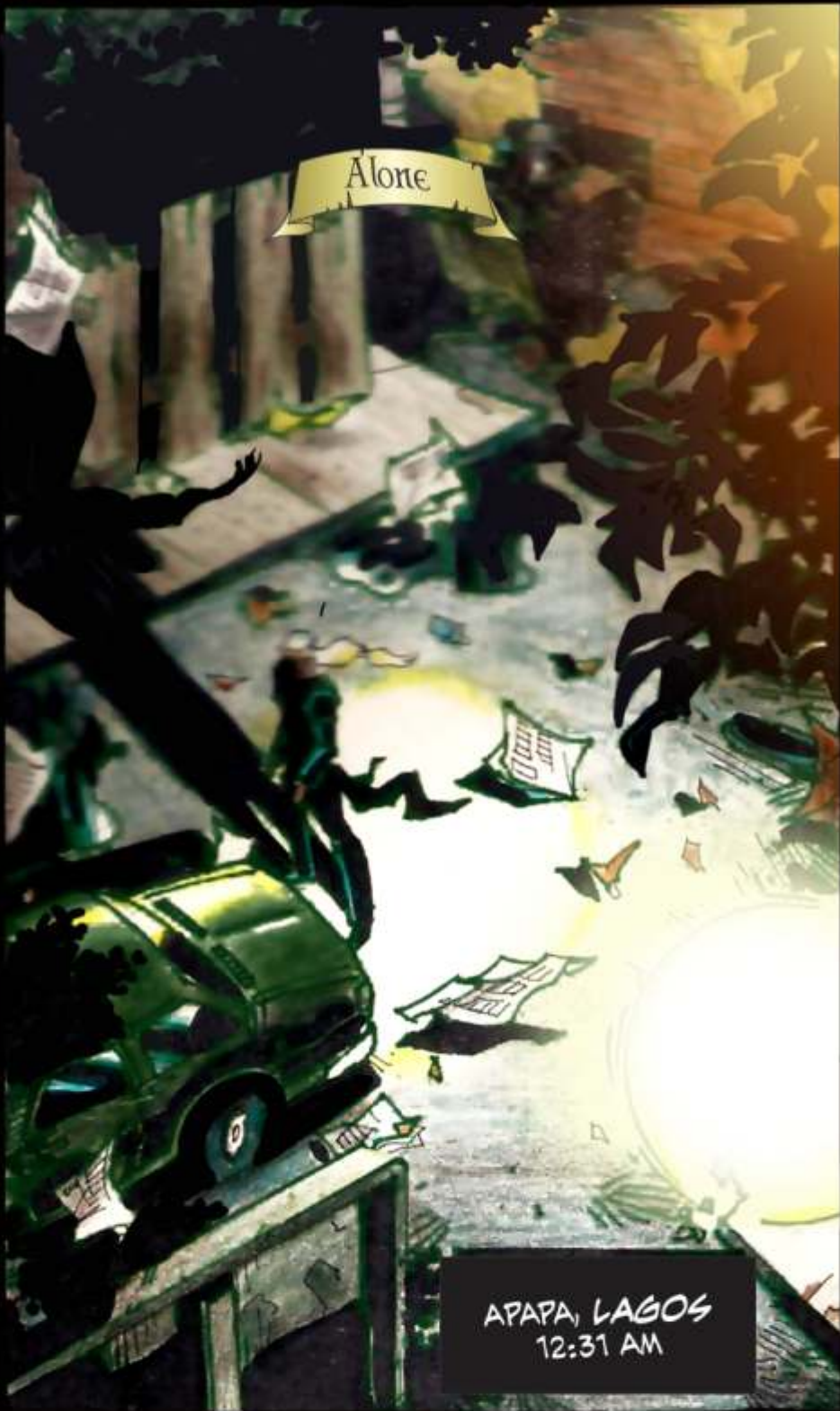
APAPA, LAGOS 12:31 AM