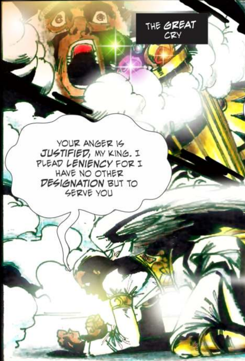
THE GREAT CRY

YOUR ANGER IS JUSTIFIED, MY KING. I PLEAD LENIENCY FOR I HAVE NO OTHER DESIGNATION BUT TO SERVE YOU